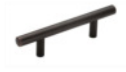
Oil Rubbed Bronze [ ]