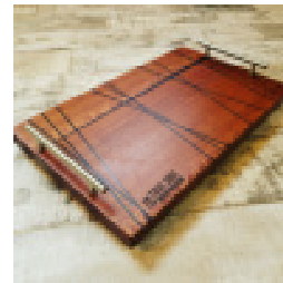
Cross Cut [ ]