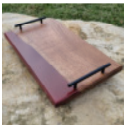
Top [ ]