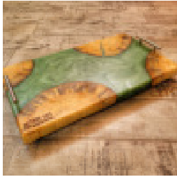
Cookies [ ]