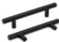
Black [ ]