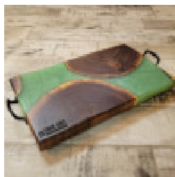
Ends [ ]