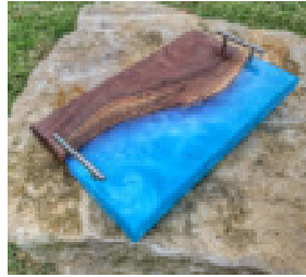
Plank [ ]