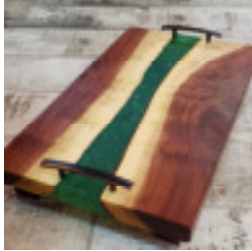
Walnut– tends to be a darker finish [ ]