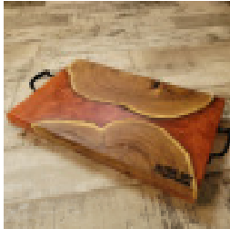
Oak– tends to be a lighter finish [ ]