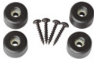
Rubber [ ]